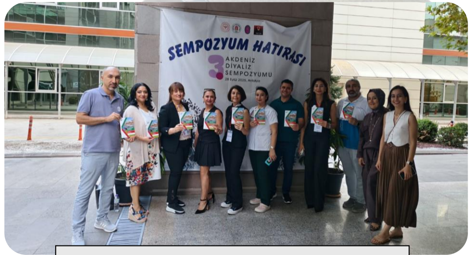
EDTNA/ERCA Porto Congress Promotional Cards