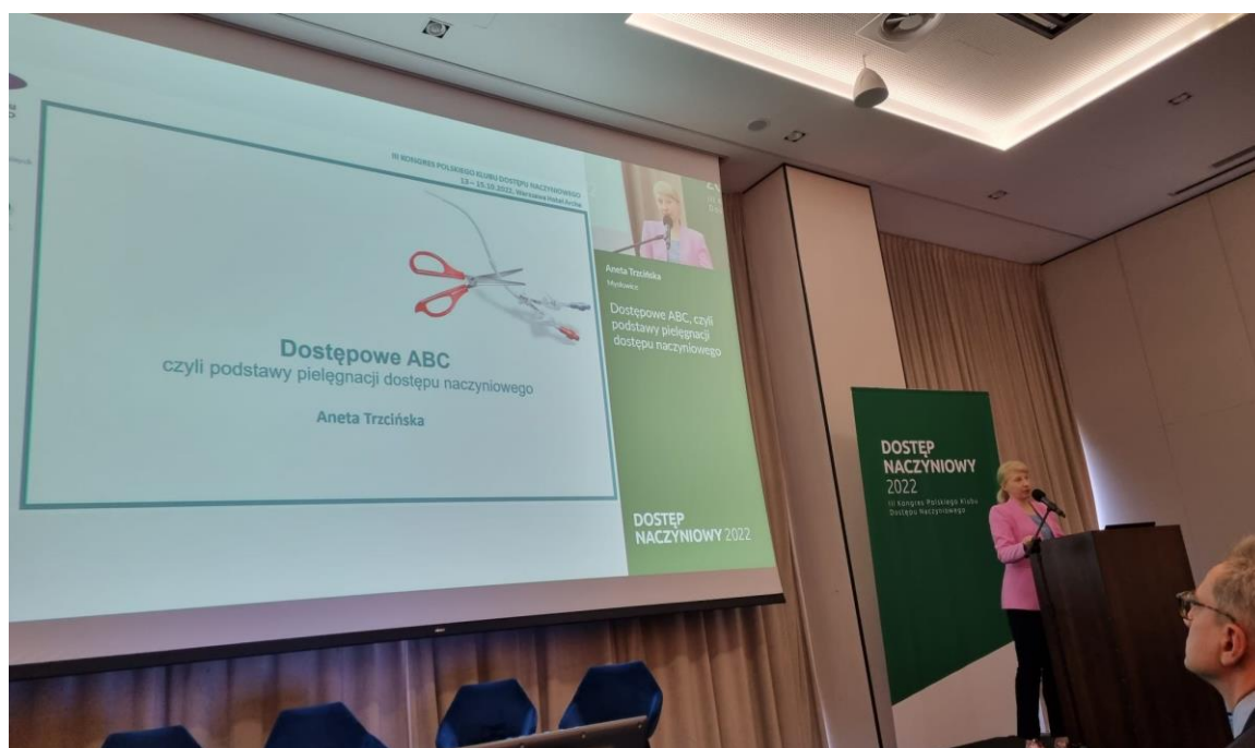
ABC of the basics of vascular access care - Aneta Trzcińska